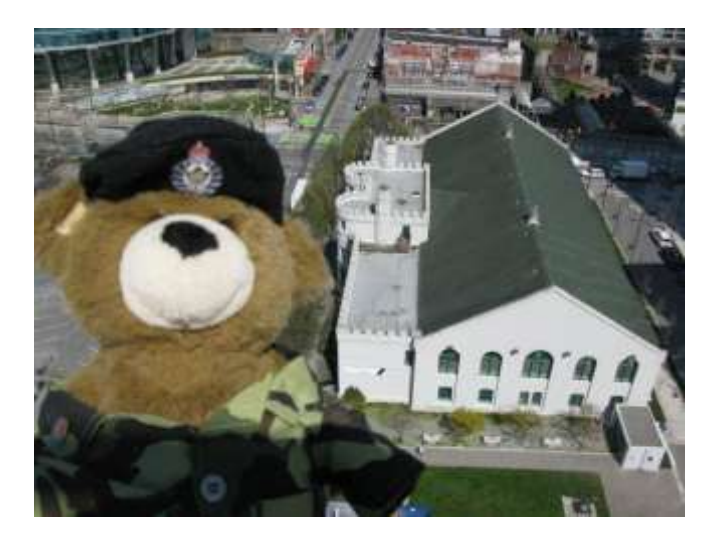
Duke on the crane (on the Concord Project) with an excellent view of the Drill Hall.