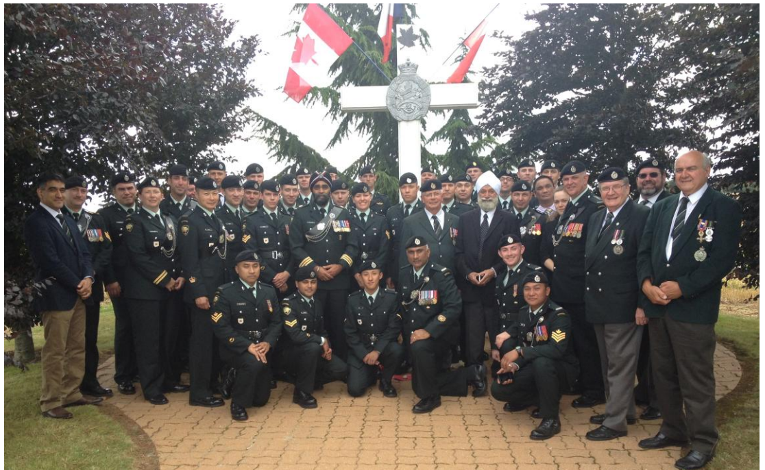
Hill 140 Memorial