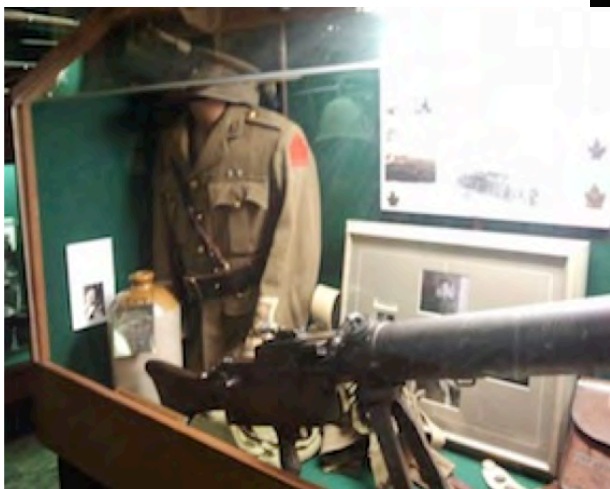
7 th Battalion Display