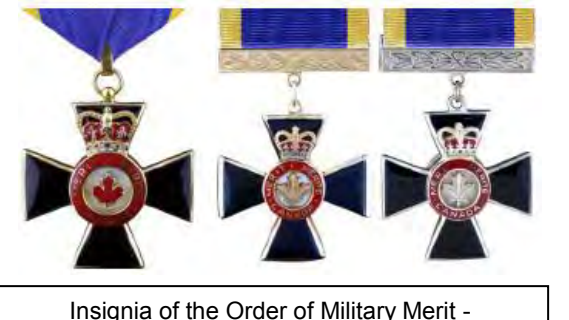
Insignia of the Order of Military Merit -Commander, Officer, Member

The badges for inductees are of a similar design to the sovereign's badge, though without precious stones, and slight differences for each grade. For Commanders, the emblem is gilt with a red enamel maple leaf in the gold central disk; for Officers, it is gilt with a gold maple leaf; and for Members, both the badge itself and the maple leaf are silver. The reverse bears only a serial number, and all are topped by a St. Edward's Crown, symbolizing that the order is headed by the sovereign. These insignia are worn with the order's ribbon, which is blue with golden edges. Commanders wear the badge at the neck while Officers and