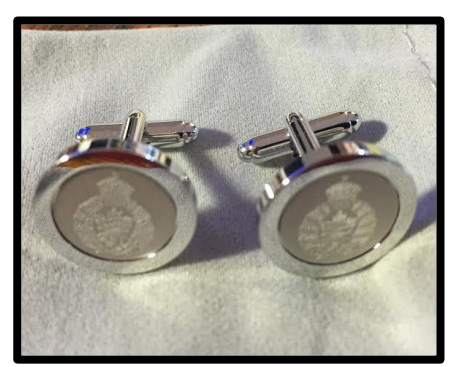
Cuff Links - $35.00