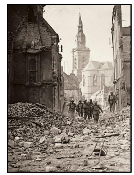
Canadians advance through Cambrai 1918

Early in October the 7<sup>th</sup> Bn received orders to proceed to Lecluse where they relieve the Rifle Brigade in the front line. On 11 October the 7<sup>th</sup> conducted a successful amphibious crossing of the Sensée River and occupied Hamel and Estrees including 75 prisioners at the cost of two wounded. From there they pushed across the Canal de la Sensee and eventually advanced to Masny, Ferin, Roucourt where they were greeted by cheering crowds of villagers, many of whom were both hungry and homeless and were grateful for the care they received by their