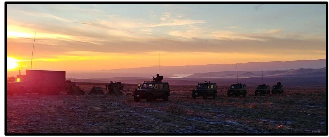
Photo: I can't recall who sent me this, but I cannot take credit for the awesome pic of 42 Tp