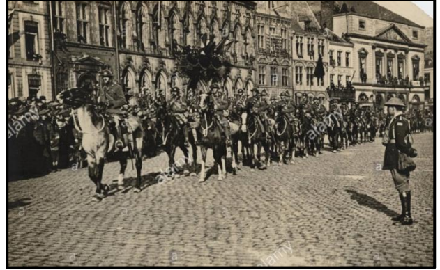
Canadian Corps enters Mons 11 November 1918

liberators. The 7<sup>th</sup> in their now back up role settled on the outskirts of the town of Auberchicourt on 21 October, and it was in this position that they received the news of the Armistace ending the war on 11 November 1918.