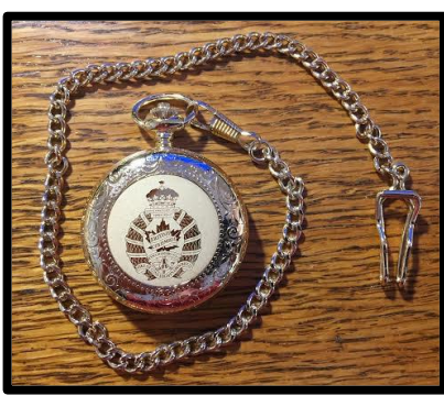
Pocket Watch - $105.00